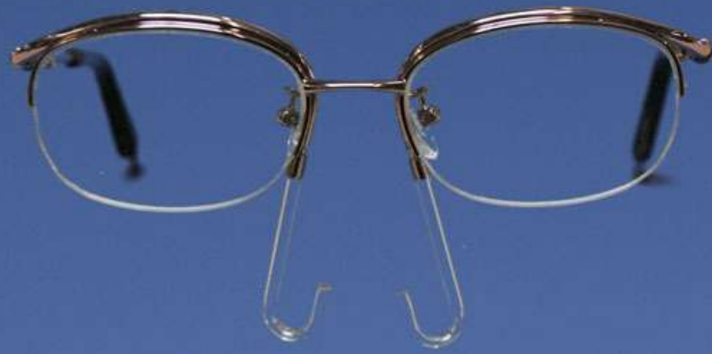
Oval Half-Rim Frame