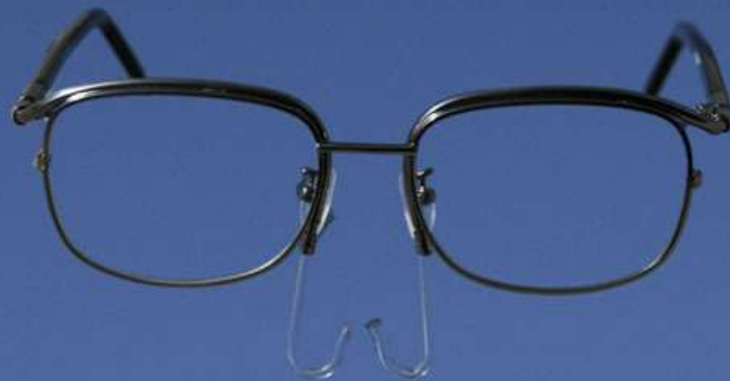
Rectangular Full-Rim Frame