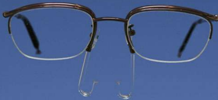
Rectangular Half-Rim Frame